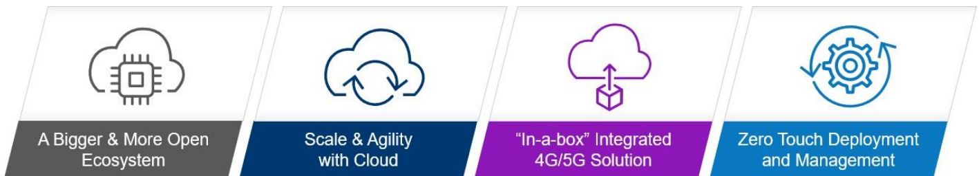
Figure 1: Mavenir's Private Network Solution Value Proposition

By taking an open architecture-based approach , Mavenir enables larger and broader ecosystems that foster collaboration to unlock the true potential of private networks.